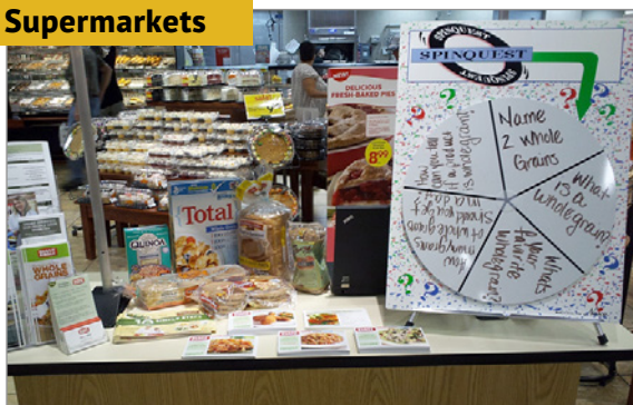
Quiz Game, Whole Grain Prizes Giant Eagle Supermarkets