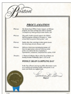
Mayoral Proclamation City of Boston