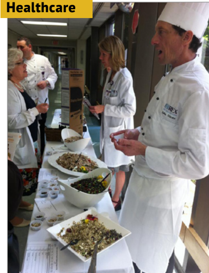
Chef Demo and RD Talk Rex Healthcare